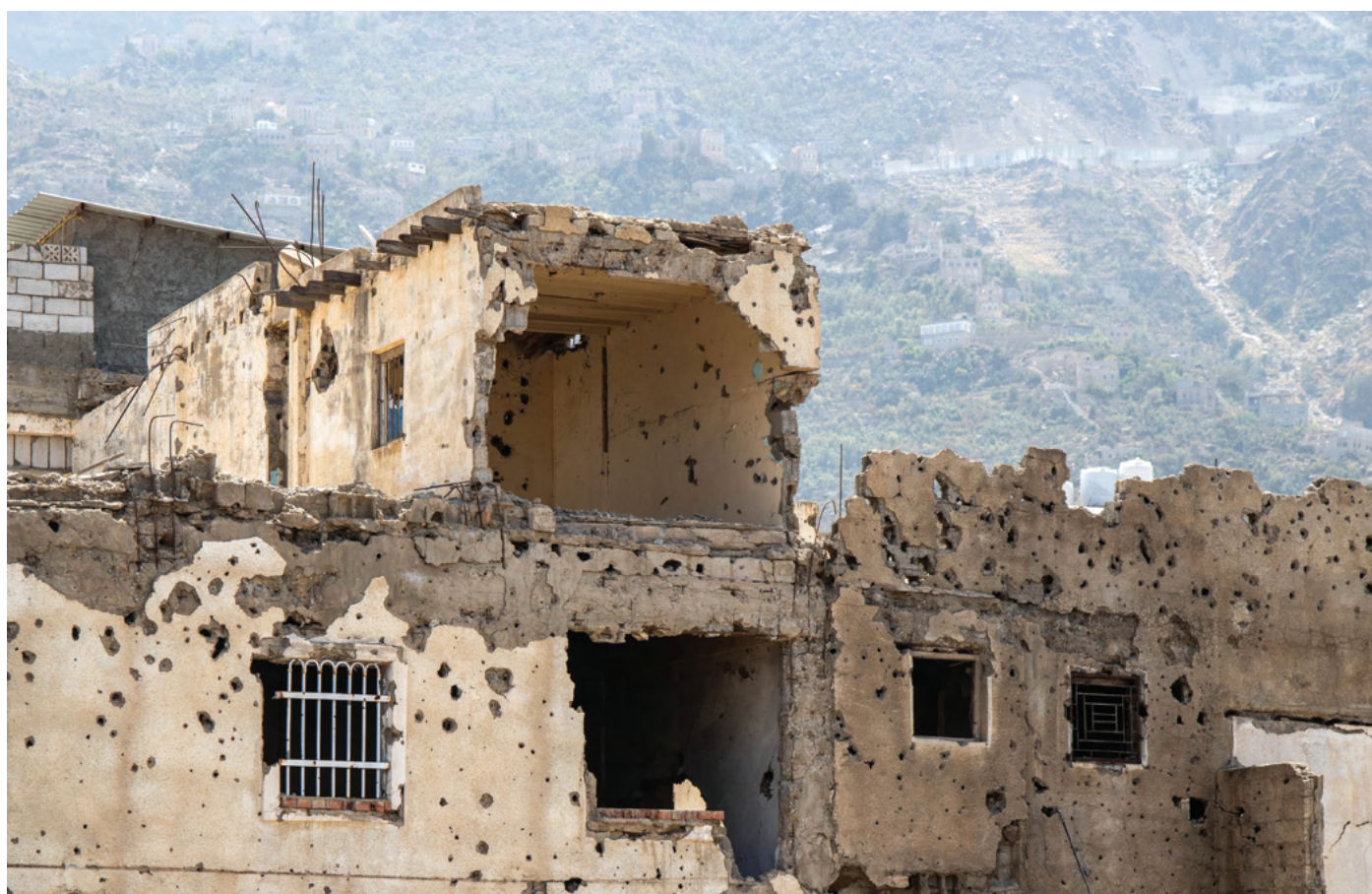
The remains of a building damage by ground fighting and bombardment in the city of Taiz, March 2022.

“Children are growing isolated and introverted; they no longer interact with their communities and peers...some have been born into this and do not know what a friend is” said an aid worker from Taiz. In fact, an aid worker in Al Dhale expressed particular concern about girls’ ability to develop their personalities and awareness in these circumstances, as to begin with, girls have very limited spaces to interact with others outside of their homes. Therefore, not being able to go to school to interact with their peers significantly affects their development, awareness and self-confidence, but most importantly, their ability to cope with stress.