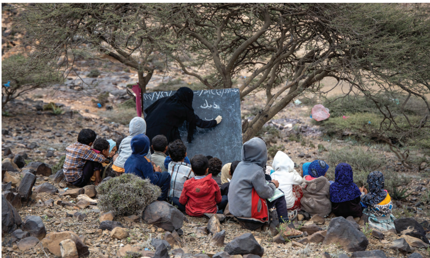
A group of student and their teacher having their class under a tree following the destruction of their school in an aerial attack in southwestern Yemen. January 26, 2021.

However, in some cases, the damage to schools is so severe that there are no safe zones where teachers and students can take shelter if the school comes under attack. “There aren’t any safety measures for contingencies, the school is already severely damaged because it has been repeatedly hit... There are no safe zones or spaces inside the school, when the school comes under attack classes are suspended and children are evacuated promptly. If the fighting is very intense, both teachers and children remained in the school until the situation calms,” said a deputy school principal from Al Dhale. Both education workers interviewed in Al Dhale reported that 60 – 80 per cent of schools in their communities have been harmed or damaged by the conflict, as well as their own schools sustaining critical and catastrophic damage.