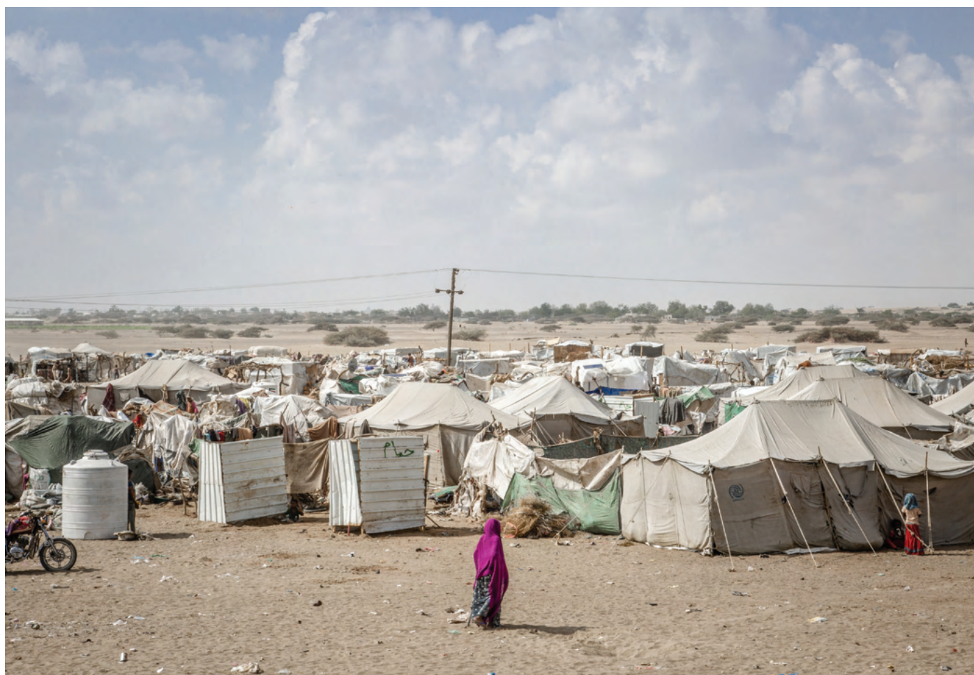
A wide shot of a camp for Internally Displaced People (IDP), Lahj, Yemen. Photo taken on November 08, 2018.

Another female nurse in Aden described a time when clashes suddenly broke out next to the hospital during her shift; “a clash between two groups occurred suddenly near the facility. It was terrifying, everyone in the health complex that day panicked, including staff and patients, everyone remained in the facility, cornered away far from windows and open areas, such as the main entrance. We stayed like this for hours, until we could no longer hear shooting outside. Even then, we feared going out, people began to move outside of the facility very cautiously, fearing clashes could erupt again.”