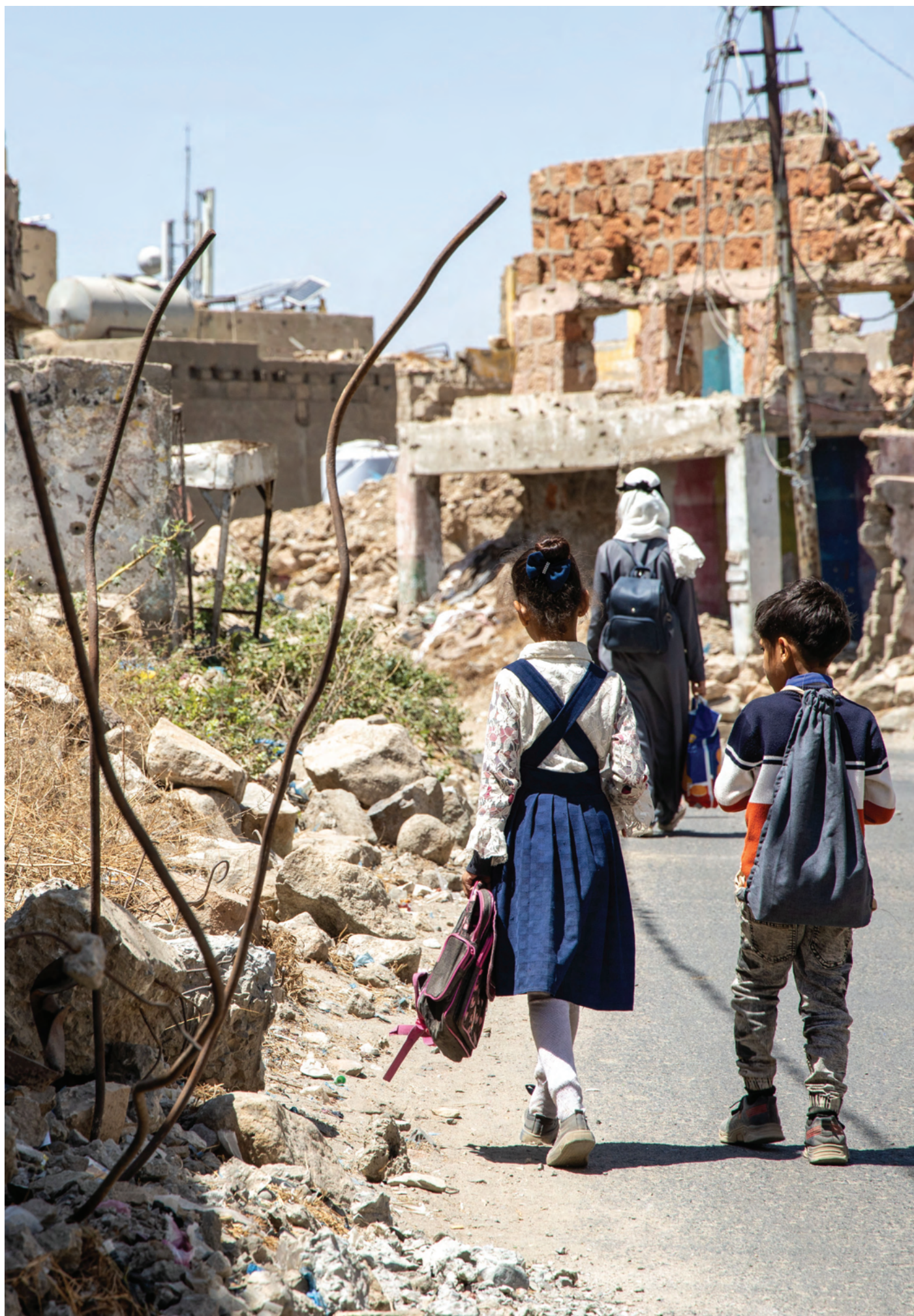
Two school kids walking back home by the ruins of buildings destroyed in bombardment in the city of Taiz, March 2022.