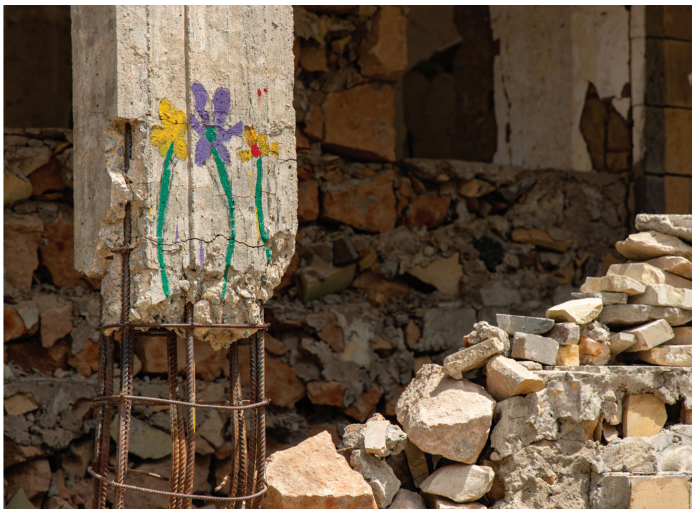
Flower mural on the ruins of school destroyed by an airstrike in the city of Taiz southwestern Yemen, March 2022.