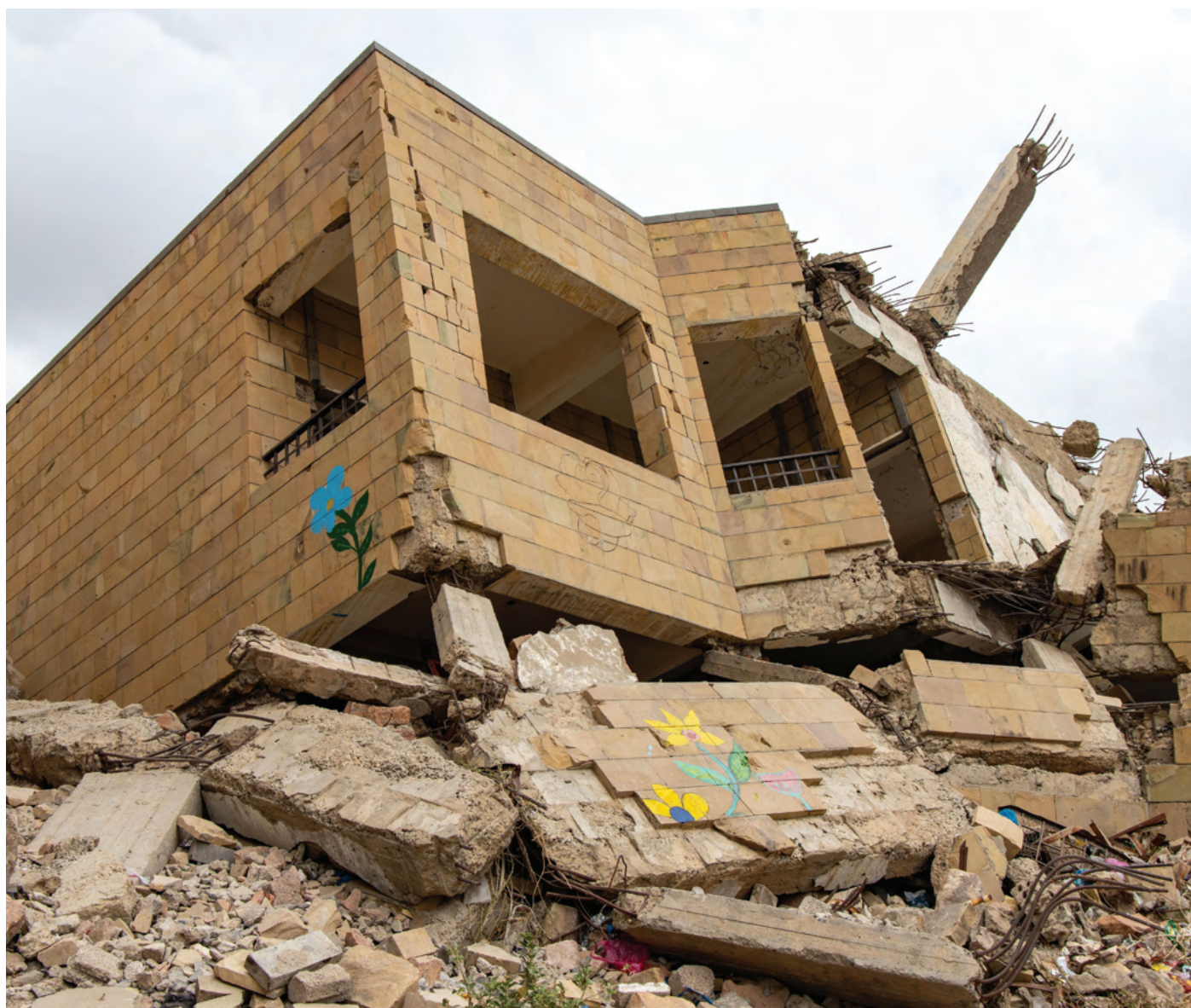
Flower mural on the ruins of school destroyed by an airstrike in the city of Taiz southwestern Yemen, March 2022.

In one incident, a deputy school principal from Al Dhale described the harrowing events when his school came under attack: “One time while at school, the school was hit by heavy artillery shelling, and several projectiles landed right next to the school, just as students were leaving. Several students were killed and injured then. This is hardly an isolated incident as it has taken place in many other schools”.