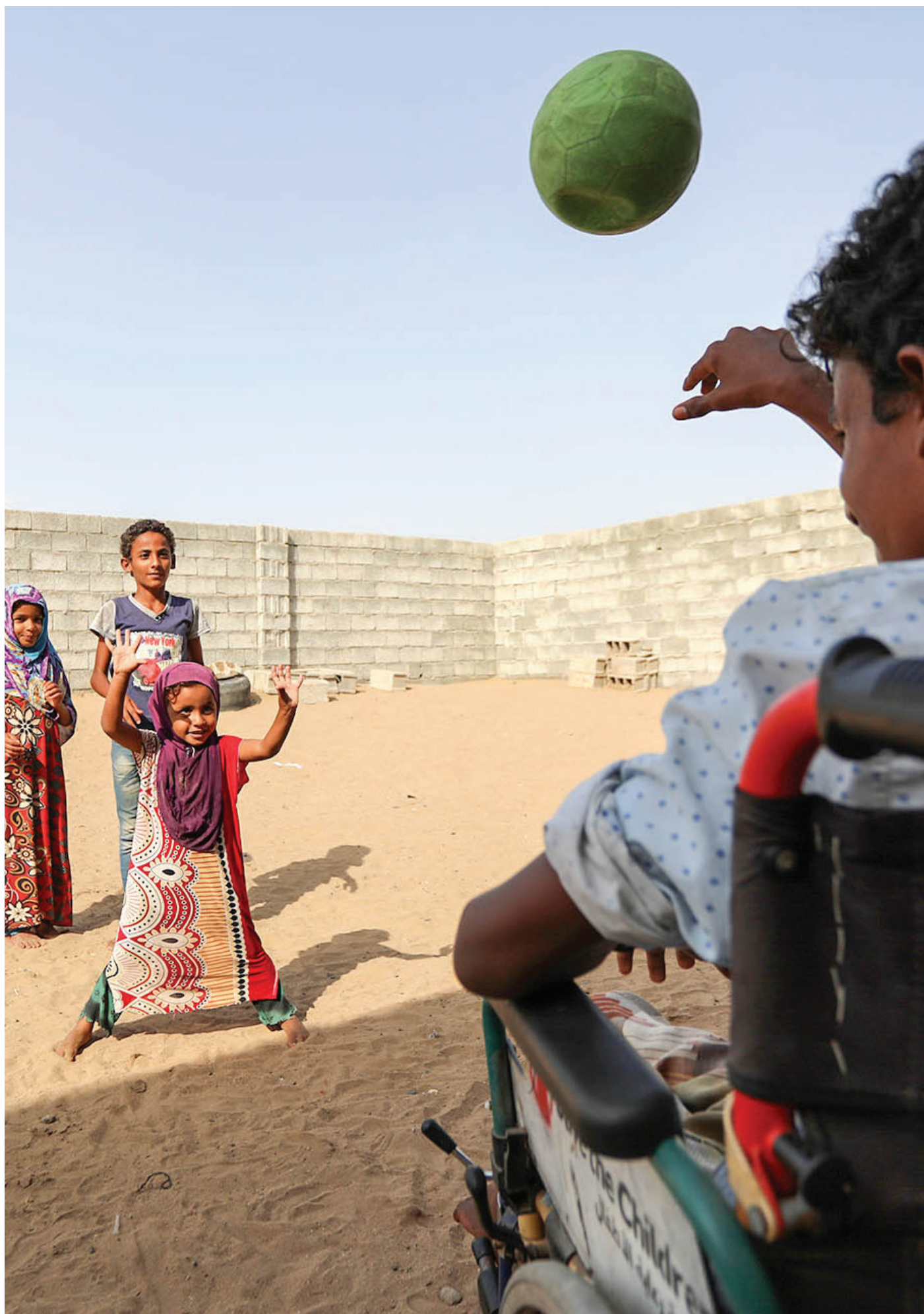
Children playing with a ball in their backyard. Photo taken on February 04, 2020.