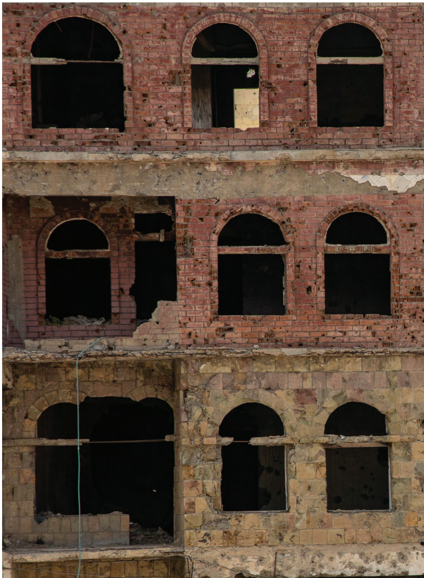
The front side of a building that sustained damage during ground fighting and bombardment in the city of Taiz, March 2022.