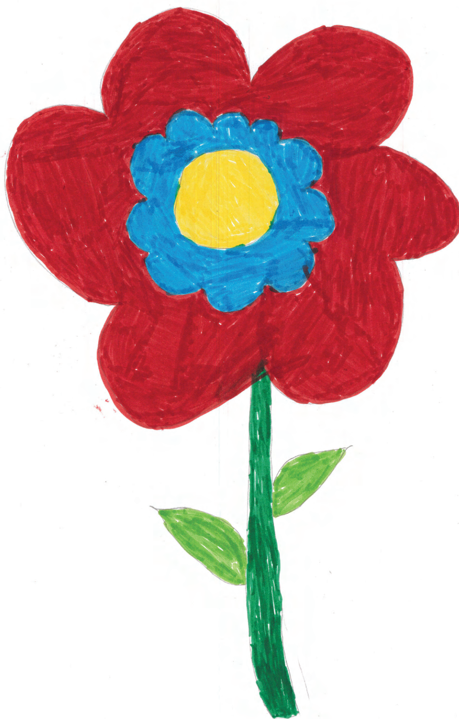
A drawing of a flower done by a 13-year-old girl from the city of Taiz as part of a drawing workshop conducted by Save the Children's child protection team in March 2022.