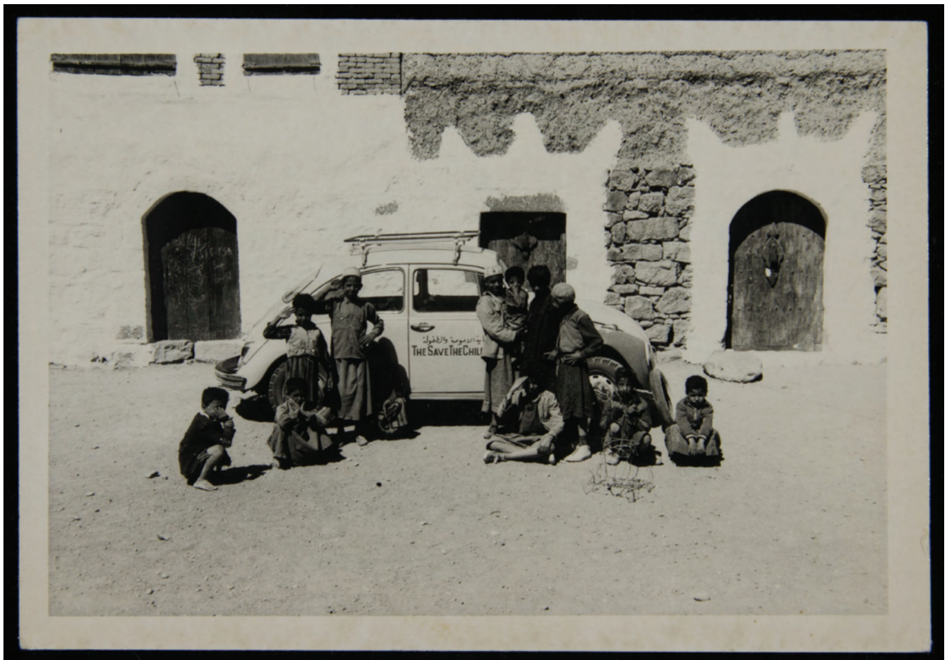
Children outside the Save the Children clinic in al-Rawdah, Yemen. c. 1972. The end of eight years of civil war gave the Fund an opportunity to establish long term development programmes. A survey carried out in June 1972 was followed by the opening of five mother and child welfare clinics, with the Fund's centre of operations at al-Rawdah. Through these clinics much assistance was given to disabled children and those suffering from polio. An immunisation programme was also introduced with work initially being concentrated on Sana'a and the surrounding area. Exact date unknown.

Since 2015, there were at least 76 airstrikes reported against healthcare facilities, including hospitals, clinics and health centres across Yemen. 4 The highest number of airstrikes against healthcare facilities was reported in Sa'ada, followed by Hajja and Taiz, and nearly half of the healthcare providers interviewed reported being present at the healthcare facility during an attack, and ninety-three per cent of health workers surveyed said that services at health facilities where they work have been repeatedly suspended due to attacks.