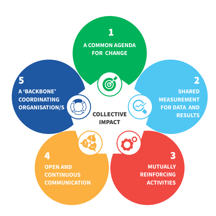
Collective impact approach